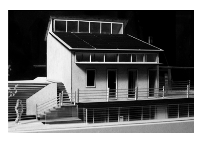
Figure 2: Sustainable Strategies in Architecture final project, utilizing a given lot and a simple design scheme

residential construction in the urban setting (Fig. 2); the other project challenges students to redesign their own school building toward a more sustainable structure. In the first case, students are given a simple, modular, design scheme, which they might use and adapt to the regional setting; this has to be proven as a successful strategy due to time constraints during the semester. For the latter project, participants have to develop ideas and technological strategies to transform an architectural award-winning concrete structure that was built in 1972, into an energy-efficient, sustainable building, without radically altering the structure's architectural appearance. For the learning experience so far, students have been able to successfully integrate necessary strategies and systems and adopt their new knowledge very well into these design challenges. As in the Sustainable Urban Design and Theory seminar, all results are posted at regular intervals on the seminar's website, providing a common and growing resource for all participants during the course of the semester [3].